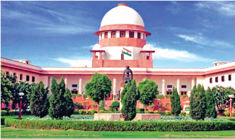
Supreme Court of India, Delhi